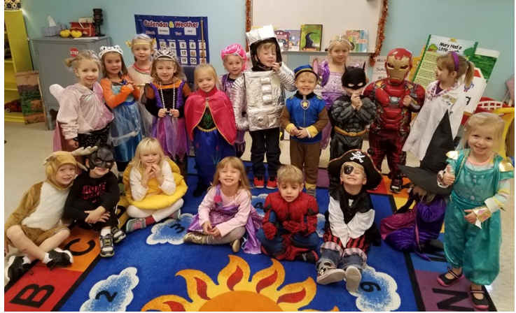
The 3K & 4K class in costume.

One thing that we love to do in our class is to have a party. We celebrated the 500th anniversary of the start of the Reformation in great style! But first, how do you teach Martin Luther to 3 and 4 year olds? Good question! We learned that there was a man named Martin Luther who lived a long, long time ago who saw the church wasn't teaching God's word correctly. He wanted to fix it so he nailed his 95 theses (statements) on the church's door. His main message was that we are saved through Christ alone! We even "nailed the 95 Theses" to our classroom door and proclaimed that we are saved through Christ alone! Our second party this month was due to good behavior! Five consecutive days of excellent behavior and we earned ourselves a donut party.